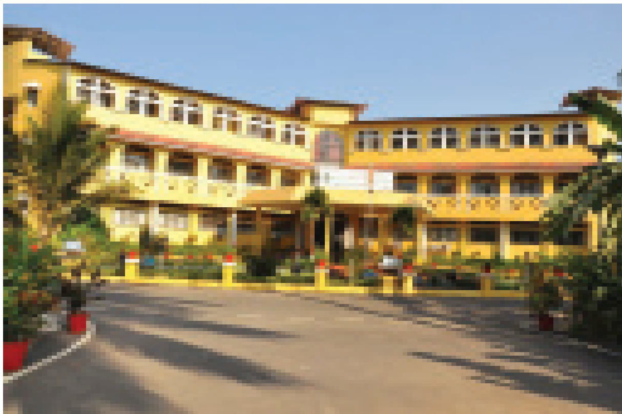
ICAR- Central Coastal Agricultural Research Institute, Goa