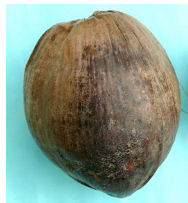
Kalyani Coconut 1