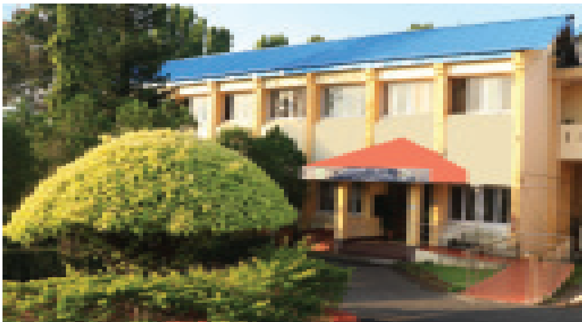
ICAR - Central Island Agricultural Research Institute, Port Blair