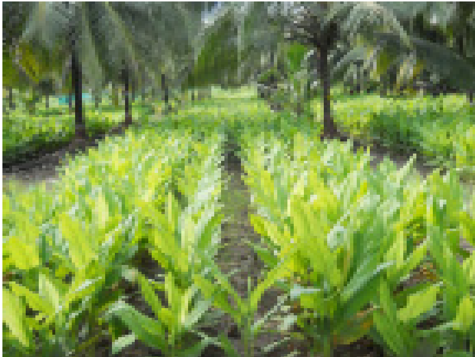
Turmeric intercropped in coconut garden (Navsari)