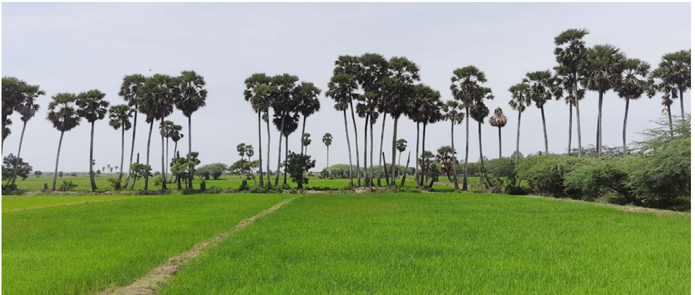
Natural view of palmyrah