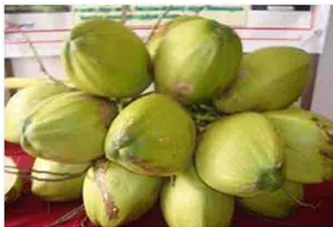
ALR (CN) 1